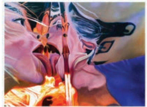
Honey Pot 2018 48" X 36" oil on panel